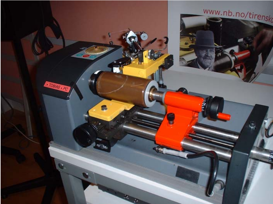
FIGURE 2. The Tobias cylinder replay machine, showing a brown wax cylinder from 1903 that has been restored at the laboratory.